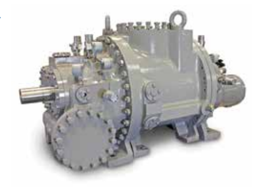
Series 408 Sleeve Bearing Tilting Pad Rotary Screw Compressor

Bottom line? Reliable, efficient, innovative systems that will serve your needs for decades to come.