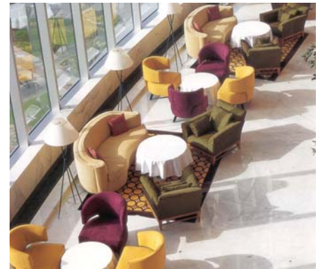
Common areas accommodate business and vacation travelers alike.