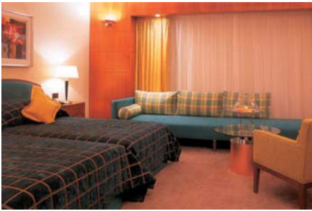
Guest rooms are configured to guest needs and showcase the latest interactive multimedia systems.

integrated for maintenance and facility management. To satisfy the increasing demand for security and property protection, CCTV and an emergency lighting system were integrated. Further integrations to the hotel management system, power monitoring system, and the staff paging system round out the picture of the intelligent building concept.