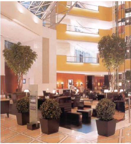
A spectacular atrium greets guests at this five-star hotel.