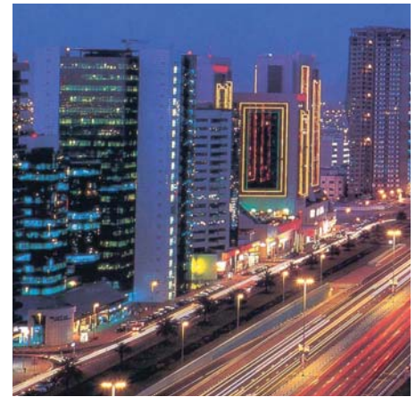
Dubai was rated one of the ten best places to work by Global Business Magazine .

One of the main highlights of the system architecture is the various integrations of different voltage systems, including chillers, elevators, and the fire alarm system. A computerized maintenance and management system was