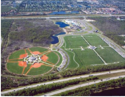
North Collier Regional Park

at these locations include video surveillance cameras and motion sensitive lighting to detect after hours access. Access gates, lighting and HVAC are all badge-controlled. All activity from these remote sites is reported back to security personnel at the building operations center.