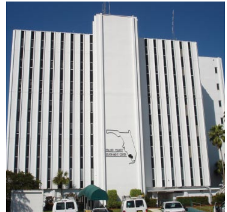
Harmon W. Turner Administration