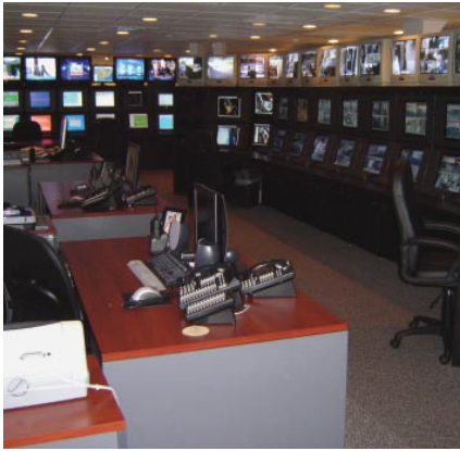
Building Operations Center

“Johnson Controls has helped us accomplish much of what we’re doing for security in the county through the use of technology instead of manpower.”