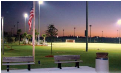
North Collier Sports Complex