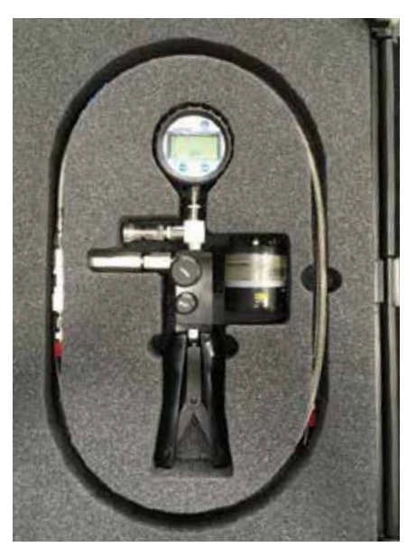
Test Pump Calibration Kit

Once testing is complete, the pump can be removed at the quick-connect to the block, and the block can be switched back to RUN position. Any test refrigeration oil used during the testing will drain harmlessly into the compressor sump without introducing non-condensable gas to the system. The test pump is then ready to calibrate the next compressor HPCO.