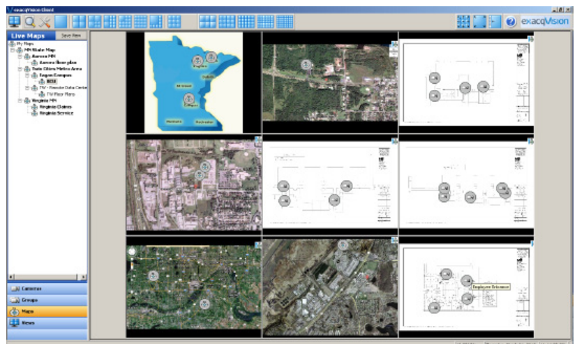
The exacqVision Enterprise software monitors multiple locations and provides the multi-level mapping functionality.

The cost-effective software licensing structure and user-friendly interface of exacqVision were key factors. exacqVision Enterprise VMS software enabled Blue Cross staff members to install, configure and navigate the system with minimal training. The simplicity of use minimized errors and reduced the overall time spent searching for video. Blue Cross' security team utilizes multi-monitor client workstations to view and administrate video