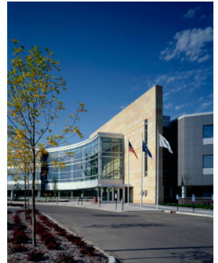
Blue Cross Blue Shield RiverPark II Building

Blue Cross decided to implement a more cost-effective, powerful network video surveillance system to protect its people, assets and internal information. Blue Cross has a security operations center, where staff members monitor video 24 hours a day to ensure assets and personnel are safe at all times. Since Blue Cross has a multi-building campus with old DVRs and over 100 analog cameras, they wanted a solution with a network video recorder (NVR) at each office location and an updated software system where they could quickly respond and report on video. Previously, security staff spent a large amount of time reviewing video on their old system.