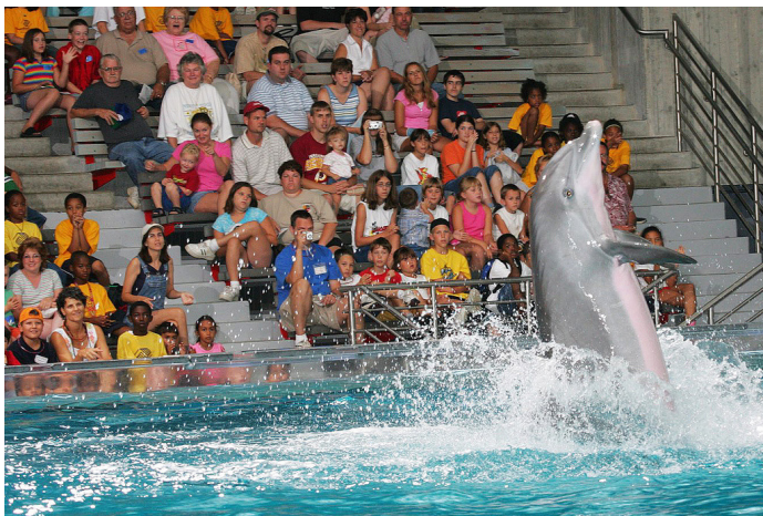
Visitors enjoy the Aquarium's dolphin show.

The security team can monitor the perimeter of the buildings, all four levels of exhibits, points of sale in the gift shop and cafeteria and high traffic areas such as the piers, Gunther Circle, dolphin show and various displays. These areas can be viewed on any computer workstation without being a burden on the network. The combination of cameras and VMS software allow the system to store more video in nearly half the space than stored with the old system.