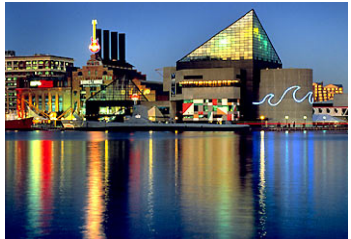
The National Aquarium is the largest paid tourist attraction in Baltimore.

The National Aquarium located in Baltimore, Maryland inspires the conservation of the world's aquatic treasures and educates more than 1.8 million visitors annually. It holds a living collection of more than 16,000 animals from more than 660 species of fish, birds, amphibians, reptiles and mammals. Located in the heart of the Inner Harbor, the National Aquarium is one of the largest and most distinctive facilities of its kind. More than 275 staff and 600 trained volunteers present visitors with eye-opening, behind-the-scenes experiences of the unexplored aquatic wonders throughout the two building, 250,000 square foot facility every day. As the largest paid tourist attraction in Baltimore, the National Aquarium strives to provide a safe environment for its local visitors to learn and explore.