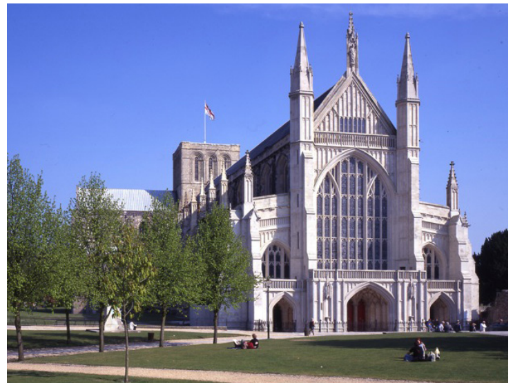
The Winchester Cathedral in Hampshire, England is one of the most magnificent medieval buildings of its kind.

The exacqVision VMS software offered the flexibility of integrating with a variety of IP camera manufacturers. To ensure the contents of the Cathedral were preserved and unharmed, ICOMM installed new IP cameras from Axis, Arecont Vision, ACTi and Sanyo. These cameras offered superior image quality and presented a solution for the lighting challenges that the previous cameras caused.