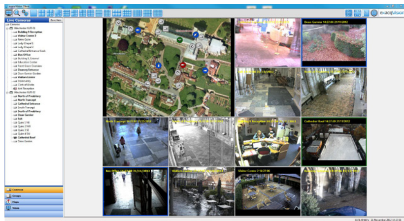
exacqVision VMS software allows Winchester Cathedral to incorporate maps and alarms into the VMS software.