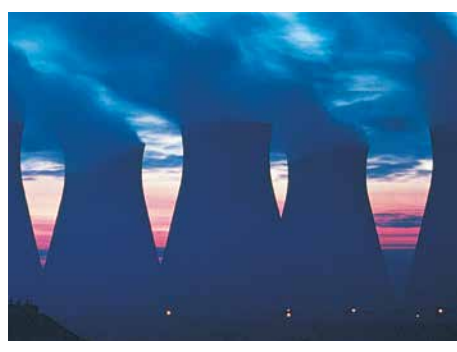
Power Generation Plants

Our BlueStream hybrid cooling system combines air-cooled and water-cooled heat rejection systems with advanced controls, reducing water usage by up to 80% while optimizing efficient energy use. Excellent for either new or retrofit applications.