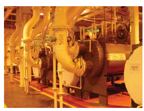
Central Chiller Plants