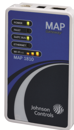
Figure 1: Mobile Access Portal Gateway

The wireless connection on the MAP Gateway allows users to be up to 31 m (100 ft, line of sight) away indoors and up to 91 m (300 ft, line of sight) away outdoors while using a supported mobile device. The MAP Gateway may be used as a portable device that can be moved from site to site, or as a stationary device attached to a controller and mounted where needed, depending on the needs and workflow of field personnel. During use, the MAP Gateway is plugged into an SA bus or FC bus.